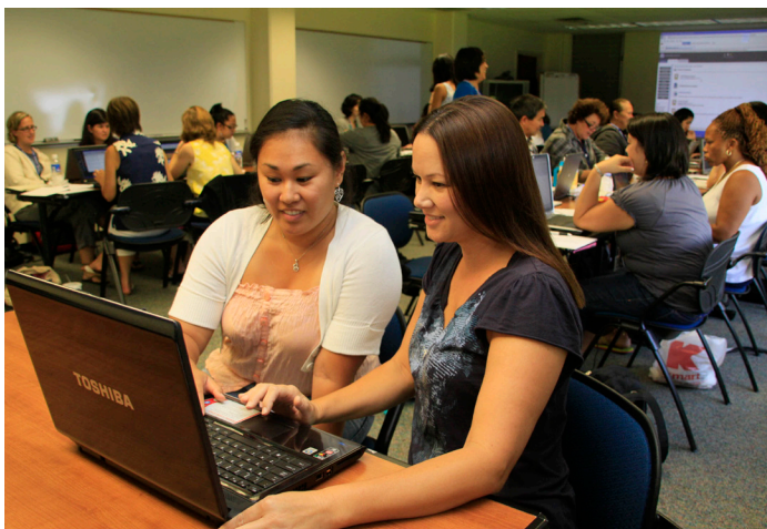
Teachers in the A’o Kumu program build capacity for 21 st Century teaching